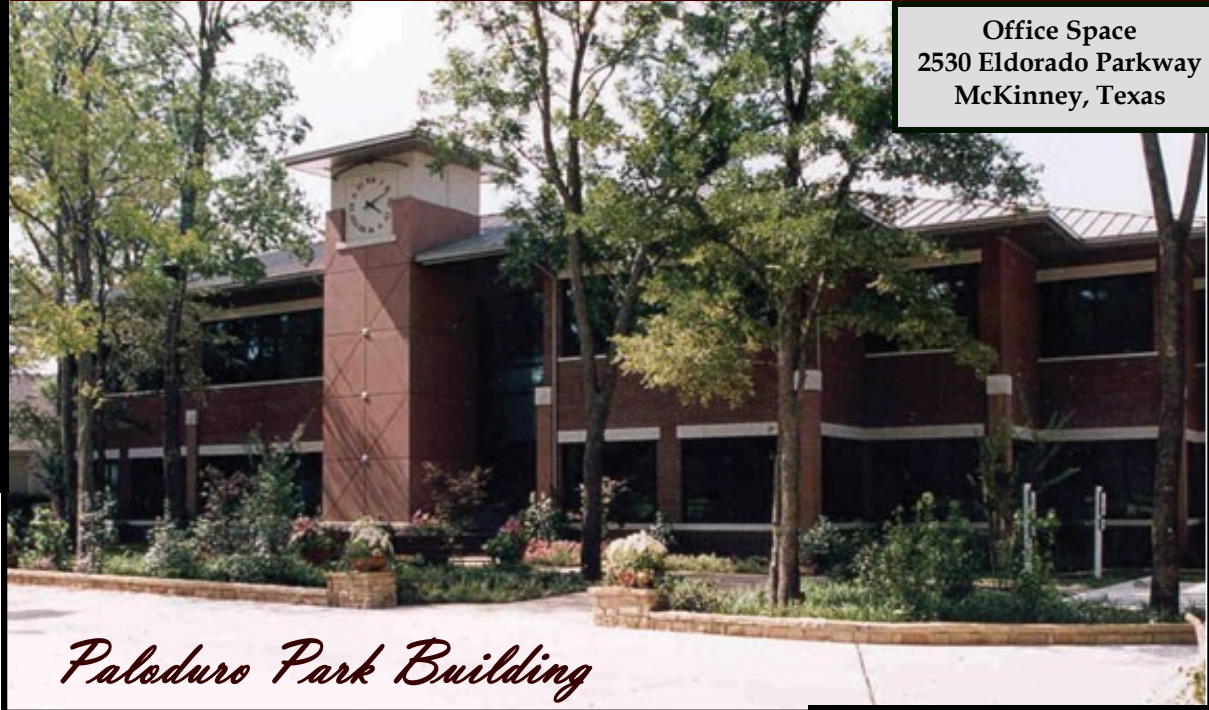
Paloduro Park Building

Office Space 2530 Eldorado Parkway McKinney, Texas