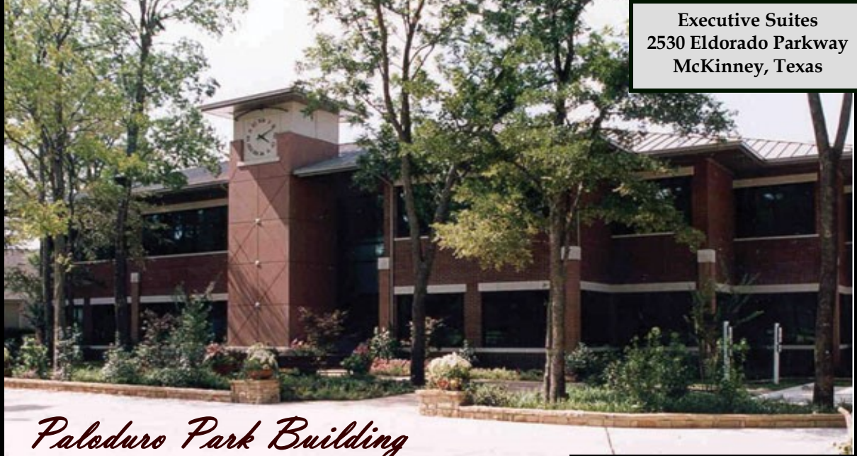
Paloduro Park Building

Executive Suites 2530 Eldorado Parkway McKinney, Texas